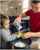
Children from Martha's Vineyard Head Start