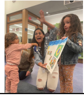
Children from Martha's Vineyard Head Start