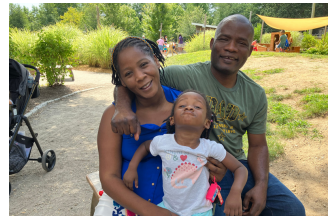
Family from Triumph Inc. Head Start