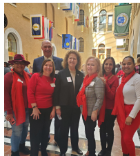
Triumph Inc. Head Start @ MHSA's Advocacy Day Event