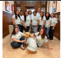
Staff at PACE Head Start

Action for Boston Community Development (ABCD) Inc. Head Start & Early Head Start Associates for Human Services Early Head Start and Early Learning Programs Berkshire County Head Start Citizens for Citizens Head Start & Early Head Start Communities United Inc. Community Action Agency of Somerville (CAAS) Head Start Community Action Inc. Head Start/Early Head Start Community Action Pioneer Valley, Head Start and Early Learning Program Community Action Programs Inter-City (CAPIC) Head Start Community Teamwork Inc. The Dimock Center Early Head Start & Head Start Programs Greater Lawrence Community Action Council Inc. Head Start Holyoke Chicopee Springfield Head Start, Inc. Lawrence Community Day Care Early Head Start LEO Inc. Head Start Making Opportunity Count (MOC) Child Care & Head Start Martha's Vineyard Community Services Head Start Pathways for Children People Acting in Community Endeavors (PACE) Head Start & Early Head Start Quincy Community Action Programs (QCAP) Head Start & Early Head Start Riverside Community Care Early Head Start Self-Help, Inc. Head Start South Middlesex Opportunity Council (SMOC) Child Care & Head Start South Shore Community Action Council (SSCAC) Triumph Inc. Head Start, Early Head Start & Early Childhood Programs Worcester Child Development Head Start Worcester Community Action Council Head Start YMCA Cape Cod Head Start & Early Head Start