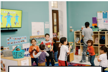
Children from PACE Head Start