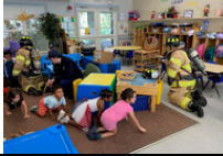
Children from YMCA Cape Cod Head Start